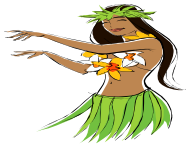
Talent show guild lines

Start working on your Island theme skits, Songs, Dance or Comedy.